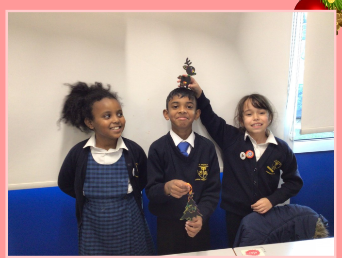
Enjoying our Christmas Crafts. Can you spot any Reindeer?