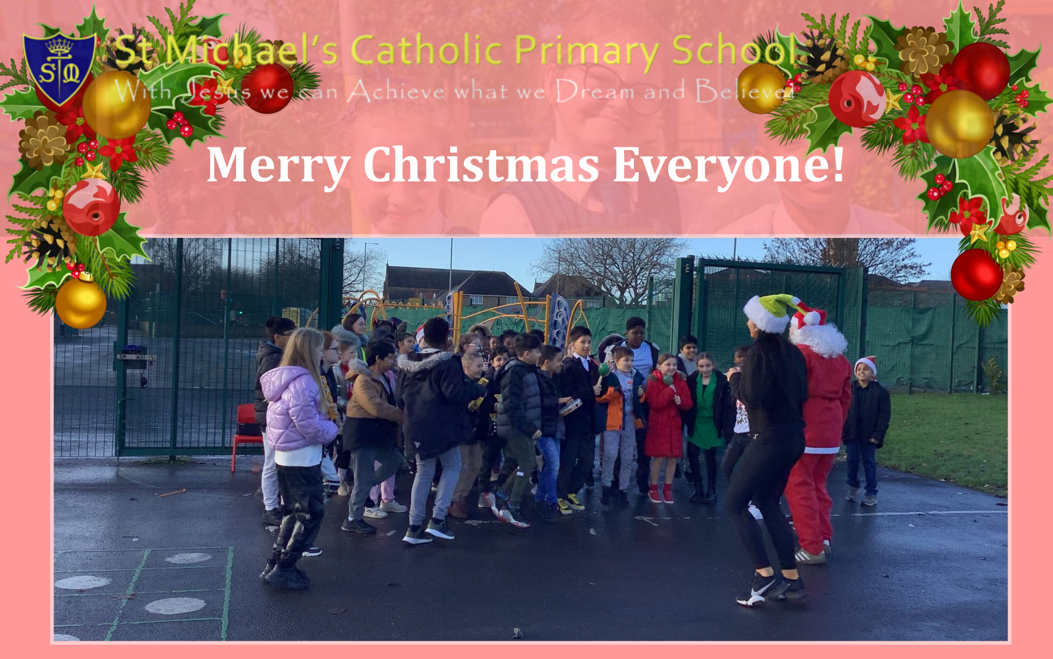
Today was our Santa dash around the yard and some of us even managed to beat Santa in the last corner!