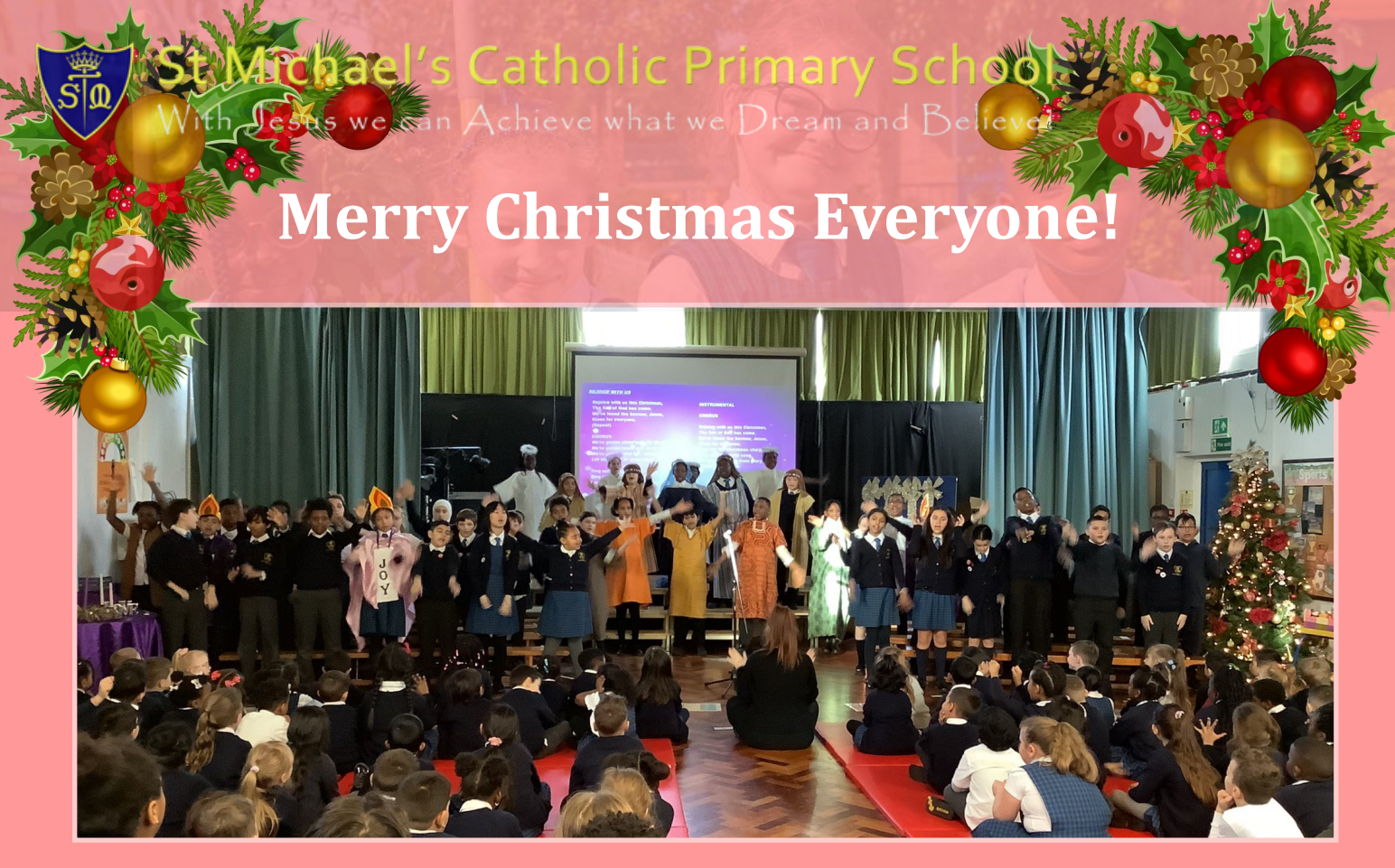
Yesterday was our final advent assembly and WOW is all we can say! Well done year 6 it was A-M-A-Z-I-N-G!!!!!