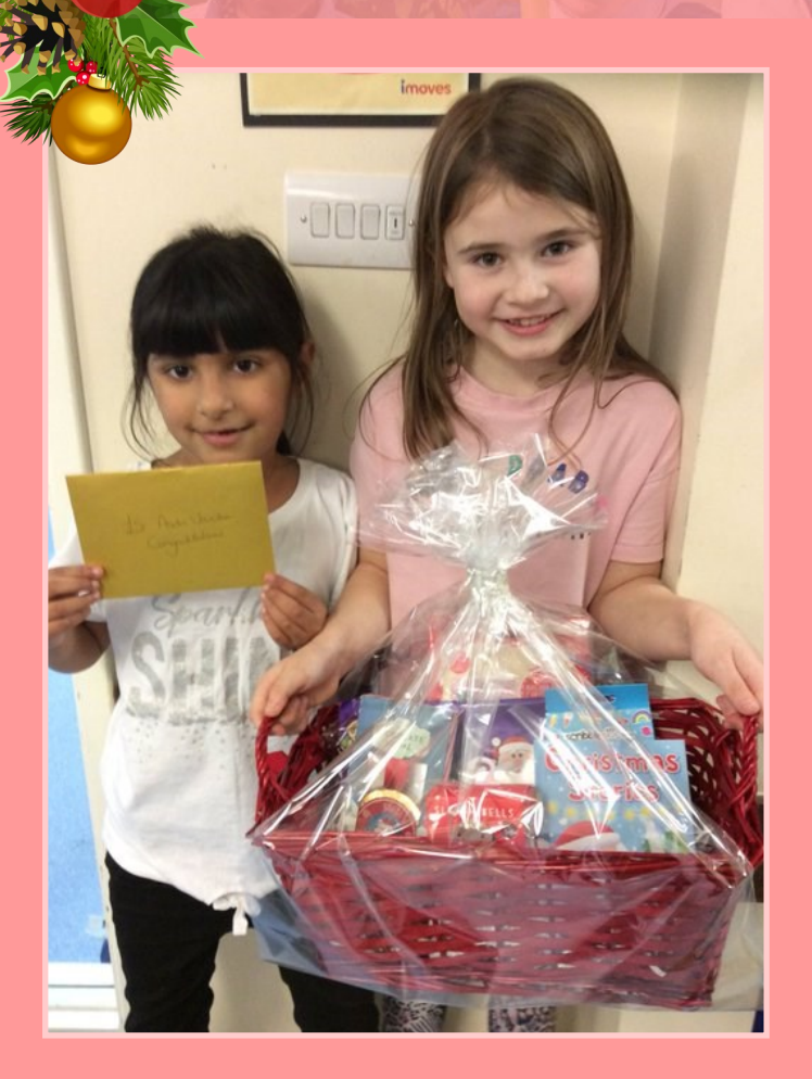
Well done to the winners of our Attendance Awards. They got a superb hamper full of Christmas goodies! Next time, it could be your family.