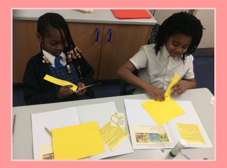
Making moving Christmas Cards