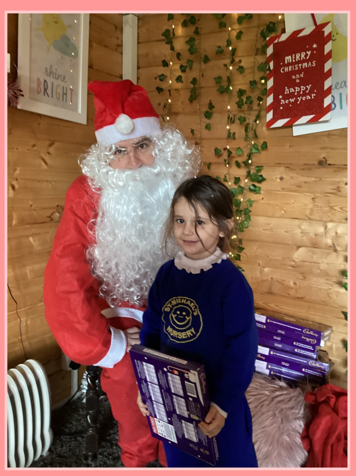
Meeting Father Christmas in our grotto. The whole school got selection boxes. Aren't we lucky?