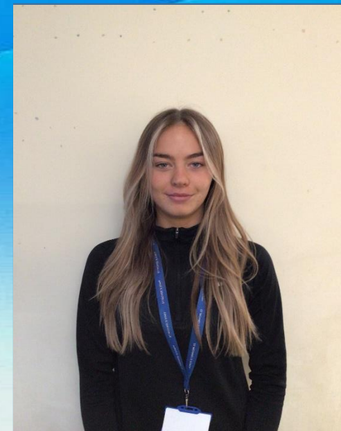
Miss Cotton LSA