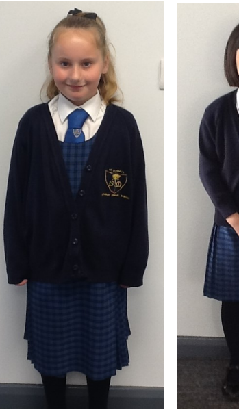
Navy Cardigan/Jumper (badged or plain) White Shirt School Tie School Kilt/Pinafore or Navy Skirt/ Pinafore Black/Grey Socks or Tights