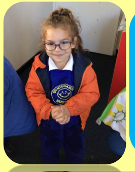
We have enjoyed meeting and playing with new friends, especially in our new home corner. We enjoyed playing with our small -world people and trains and tracks, developing our imagination and making up different games.