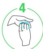
The back of the fingers