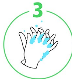
3 In between the fingers