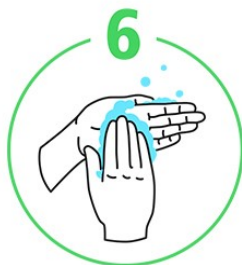
6 The tips of the fingers

Use a tissue to turn off the tap. Dry hands thoroughly.