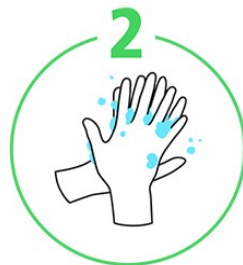
2 The backs of hands