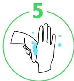
5 The thumbs