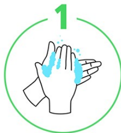
1 Palm to palm

Wash your hands with soap and water more often for 20 seconds