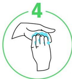
4 The back of the fingers